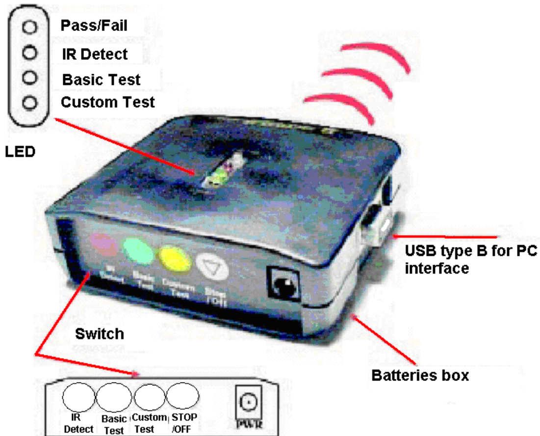
Fig. 1 ACT-IR3200M

Fig.1 is view of ACT-IR3200M. It has an USB type B connector on side, an IR window at the front and 4 LED on the top and two keys on the rear. It can work with IR3200SW or work alone. IR3200SW is software runs under PC's Windows system and it allows user to set up different baud rates B.E.R. test to DUT.